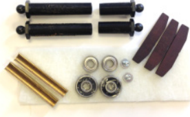
MM200e-SK 2 years Recommended Spares Kit