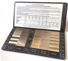
RBC0130 Surface Comparator – Multi Discipline